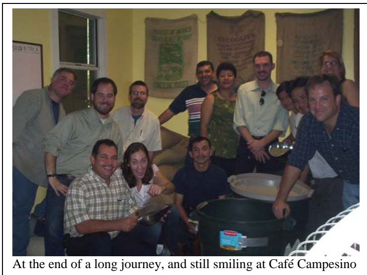
At the end of a long journey, and still smiling at Café Campesino