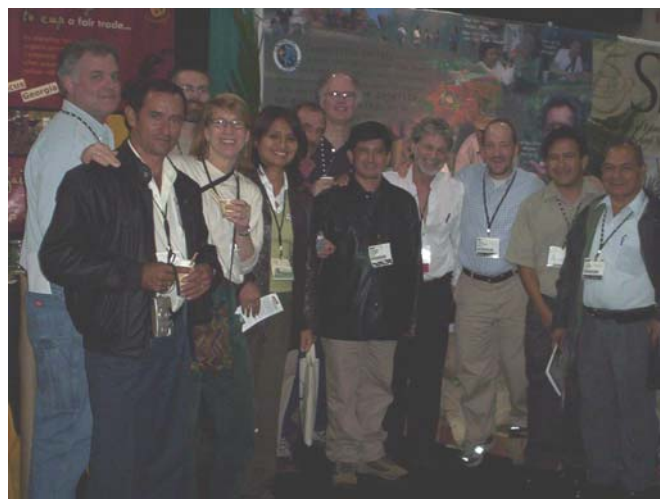
Bongo Java, Larry's Beans, Café Campesino and Cooperative Coffees showed creativity and style, displaying their wares during the 2004 SCAA Conference in Atlanta. Here, Cooperative Coffees representatives meet the Peru delegation during a tour of the back-to-back booths.

KFT and C.C. have agreed to work together in initiating a pilot project to introduce Fair Trade to Kenyan coffee growers, as well as availing the much-awaited Fair Trade Kenyan coffee to North American consumers.